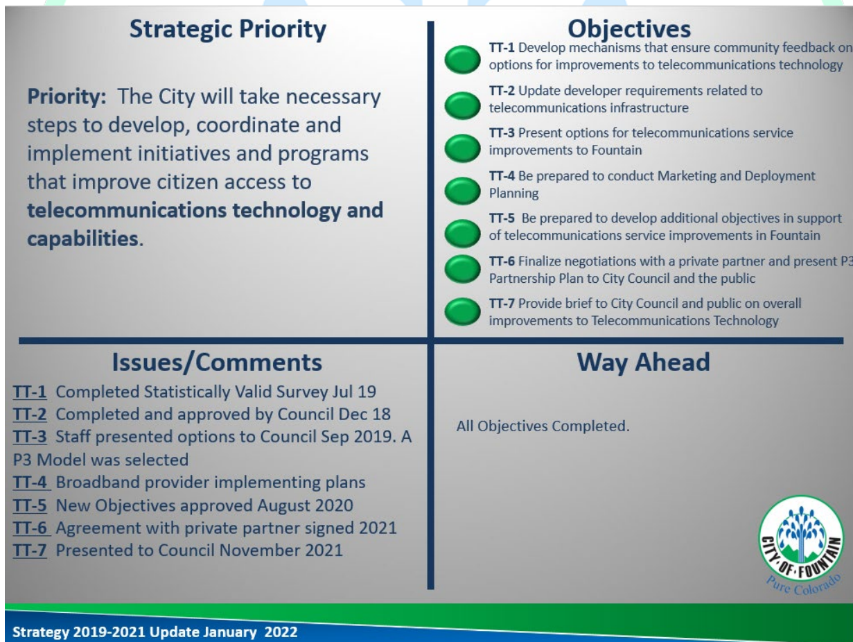
Sample of an update to City Council and the Public of the last Strategic Plan, 2019-2021

As directed by City Council, the City Manager will conduct quarterly in-progress reviews with City Staff to monitor progress in accomplishment of the Strategic Objectives contained in this strategy. On a bi-annual basis, the City Manager will present to City Council and the public a report on the strategy's implementation including updates, observations, and recommendations to Council for consideration. These reports and presentations will be made available to the public via the City's website, www.fountaincolorado.org , or by request through City Hall, at 719-322-2000.